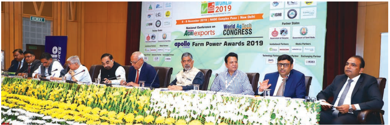
Winners of the Apollo Farm Power Awards with the distinguished CEOs panel at World Agtech Congress