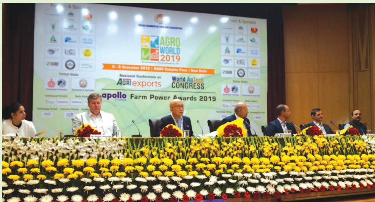
The India International Agro Trade and Technology Fair was part of AgroWorld 2019. Major events at the Fair included Farm Tech World, Digi Tech World, AgTech World and AgPro Tech World

IOT, BIG DATA, DRONES AND ROBOTICS WILL PLAY MAJOR ROLE IN PRECISION FARMING, HIGHER PRODUCTIVITY AND QUALITY