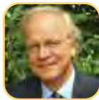
H.E. Mr. Alphonsus Stoelenga Ambassador of Netherlands to India

ICFA shall work towards highlighting the challenges faced by trade and agribusinesses in an environment which is becoming increasingly risk-prone and unpredictable. The Council shall focus on policy issues related to environmentally, socially and economically sustainable ways of building resilience and empowering resource poor farmers on one hand and facilitating global trade and marketing by promoting entire value chain - from "farm to plate".