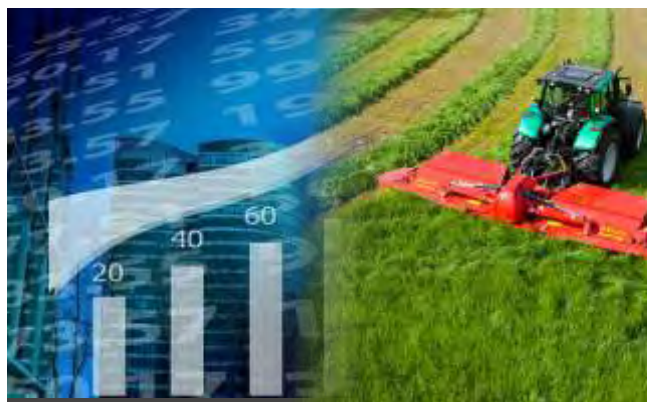
Farmer Market Linkages & Agribusiness Services