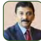
Siraj A Chaudhry Chairman, Cargill India Limited

I am truly impressed by the entrepreneurial zeal in Young India and its achievements in ICT and other areas. Indian agriculture has also come a long way from the deficit days to surplus situation. However the qualitative improvement in production and food safety and standards can help the country greatly access the global market potential and thus help farmers substantially improve their income levels. ICFA can play an important role.