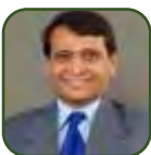
Mr. Suresh Prabhu Hon'ble Minister of Railways, Government of India

Indian agriculture has come a long way from the days of "ship to mouth" in fifties and early sixties to now a situation of surplus production in major grains, post Green Revolution. The time has come for Indian food and agriculture to go global. Indian Council of Food and Agriculture is uniquely placed to facilitate trade, partnerships and global cooperation in food and agriculture.