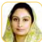
Mrs. Harsimrat Badal Kaur Hon'ble Minister of Food Processing Industries, Government of India

India and Netherlands have got strong scope for cooperation and partnerships in food, agriculture and dairy sectors. ICFA can play critical role in bringing agro food industry and entrepreneurs of the two countries closer and facilitate greater cooperation.