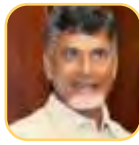
Mr. N. Chandrababu Naidu Hon'ble Chief Minister, Government of Andhra Pradesh

We realized the need for creating an apex body in food and agriculture to work on trade and policy issues and represent the interests of various stake-holders at the national and global level and thus started consultations way back in 2003. I am sure ICFA will deliver for Indian farmers and for global food trade and agriculture.