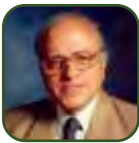
Prof. MS Swaminathan, Pioneer of India's Green Revolution

Problems of India agriculture are largely known to us but innovative solution are required to address the lot of farmers. ICFA can work on major issues to support the Governments by mobilizing national and global expertise, investments and technologies in agriculture.