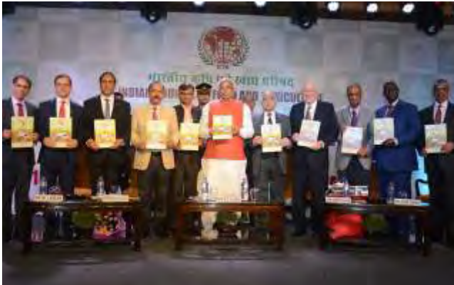
Policy Advocacy and Advisory Research