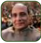
Mr. Rajnath Singh Hon'ble Home Minister, Government of India

I am happy to launch Indian Council of Food and Agriculture. India needed for long a body like this and I am sure ICFA will effectively represent the interests of various stake-holders to help Indian agriculture. Farmers need voice and I urge ICFA to work towards empowering farmers.