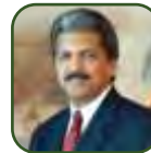
Anand Mahindra Chairman and MD Mahinda Group

"The food processing sector is of enormous significance for India's development as it provides an important link between agriculture and manufacturing. The food processing sector will help ensure better remuneration and market access for farmers and also reduce high level of wastages. ICFAI will help develop food processing industry which will ensure value addition and generate additional employment opportunities thus leading to better socio economic condition of our society."