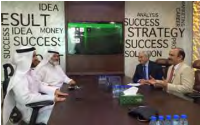
Trade Facilitation and Global Market Access