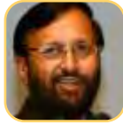
Mr. Prakash Javadekar Hon'ble Minister of Human Resource Development

Indian agriculture has got tremendous potential but it needs transition to become more market oriented for farmers to get best returns. I see great role for ICFA in connecting farmers with the markets nationally and globally by promoting trade and agribusinesses.