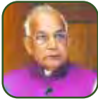
H.E. Prof. Kaptan Singh Solanki Hon'ble Governor of Haryana

I am happy to launch Indian Council of Food and Agriculture. India needed for long a body like this and I am sure ICFA will effectively represent the interests of various stake-holders to help Indian agriculture. Farmers need voice and I urge ICFA to work towards empowering farmers.