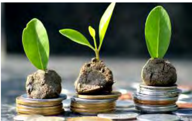
Technology and Agri Startups Facilitation