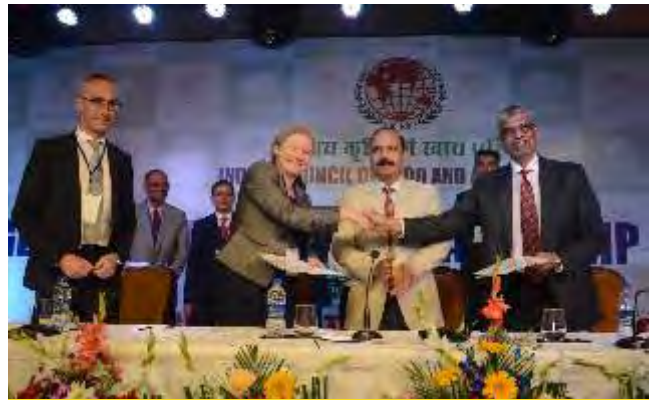
Global Platform for Dialogue & Partnerships