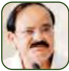
Mr. M Venkaiah Naidu Hon'ble Minister of Urban Development, Government of India

Our first Prime Minister Pt. Jawaharlal Nehru had given a call of Jai Jawan and Jai Kisan (long live soldiers and long live farmers). The time has come to care for farmers. Prime Minister, Mr. Modi has announced renaming the agriculture ministry as the Ministry of Agriculture and Farmers Welfare. We hope, ICFA will be able to work with the Government on the agenda of farmers' welfare.