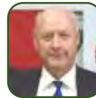
H.E. Mr. S Freddy Ambassador of Denmark to India

India has got everything that a robust agriculture needs, but we are still lagging much behind the global average in yields and in exports. We need best of global technologies, need investments in agriculture and above all we need to position Indian food and agriculture globally. I am looking up to Indian Council of Food and Agriculture to play that role and facilitate the Government of Haryana in finding solutions to the problems we are facing.