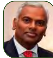
Amb. C. Rajasekhar OSD (States), Ministry of External Affairs, Government of India Hyderabad