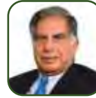
Mr. Ratan N Tata Chairman, Tata Group

India is leading producer of milk, horticulture and a number of agricultural items but as we know the processing and value added activities are low and producers market connect is the major challenge, resulting into low returns from farming. ICFA can play a critical role in connecting the farmers with the market and accelerate the growth of agribusinesses.