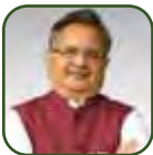
Dr. Raman Singh Hon'ble Chief Minister, Government of Chhathisgarh

I am glad to see that Indian Council of Food and Agriculture is being launched today. India's farm sector is looking for policy support. Our Government is fully committed to strengthen agriculture to help improve social and economic condition of farmers. ICFA can play a great role in creating understanding and consensus on major issues concerning farmers and Indian agriculture.