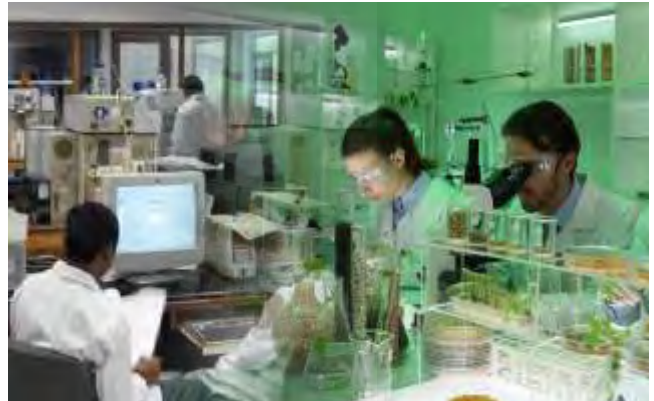
National Knowledge Resource Centre