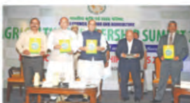
ICFA members and officials at a meeting. The group includes representatives from various agricultural sectors and government officials.

Agriculture in India continues to be a powerful engine for rural economic growth and social transformation with over 50% population directly dependent for its livelihood and sustenance. Indian agriculture is however, presently undergoing a rapid transformation since the onset of economic reforms during early 1990s and the emergence of post WTO regime, governing the global trade in food and agriculture. A paradigm shift is required in our approach to agriculture, from production to marketing, from quantity to quality and demands to international consumers. Agriculture has to be done on scientific lines with the use of best technologies for to compete globally in cost and quality. The up and down stream business needs to be promoted in agriculture to enhance value addition, profitability and employment generation. The importance of research and innovation in the sector is enhanced on account of the connectivity of food and agriculture in the global trade, post WTO.