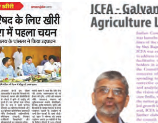
Members of the ICFA Working Group for the North Eastern Region at a meeting.

The ICFA Working Group for the North Eastern Region has been formed. The group will focus on addressing the specific challenges and needs of farmers in this region, including issues related to infrastructure, market access, and agricultural practices.