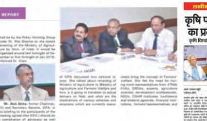
Participants at a meeting.