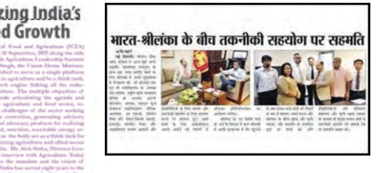
Participants at the meeting on 'Doubling Farmers Incomes through Agro, Food Trade'.

A meeting was held to discuss the strategies for doubling farmers' incomes through agro and food trade. The meeting was attended by officials from various departments and experts in the field. The discussion focused on improving market access, reducing post-harvest losses, and enhancing the value chain.