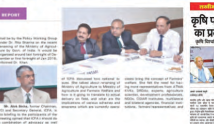
Participants at the Round Table Meeting of ICFA Policy Group on "Farmers' Welfare - Identifying the Issues".

The ICFA Policy Group has held a round table meeting to discuss the issues related to farmers' welfare. The meeting was attended by experts and officials from various departments. The group identified key areas for improvement and discussed strategies to address the challenges faced by farmers.