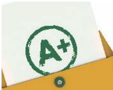
Research and Rating Services

ICFA as part of its mandate to act as global platform for services, partnerships and enterprise development, has created various business and facilitation platforms to help the key stake-holders across the spectrum to access support, services and expertise of ICFA to help unleash their potential, leading to positive eco-system and overall growth of the sector. Major services and platforms, being operationalized by ICFA directly and through its strategic partners are: