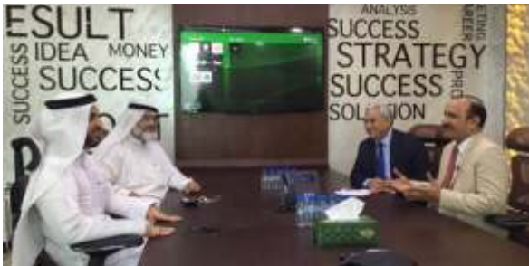
Trade Facilitation and Market Access