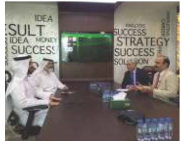
Business and trade Facilitation Services