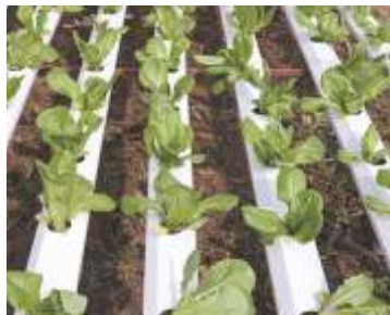
Technology and Innovations Platform