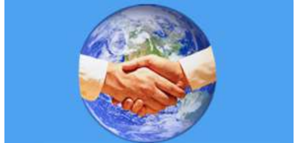
Global Platform for Dialogue and Partnerships