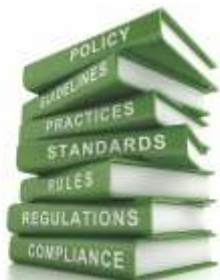
Policy and Regulatory Support Services