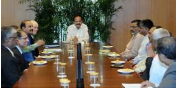
Policy Research and Advocacy