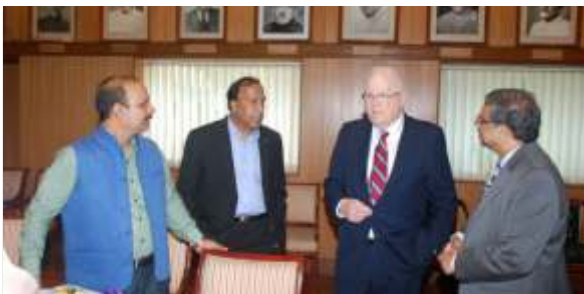
Technology and Agri Startups Facilitation