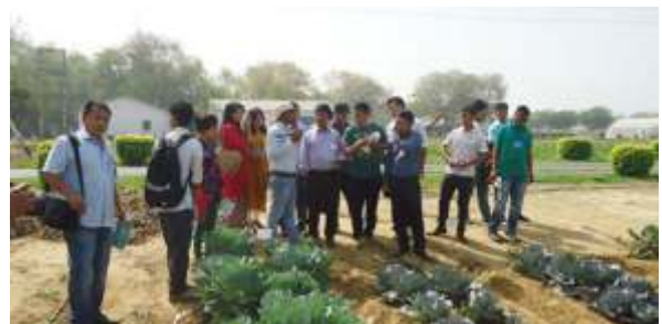
Farmer Market Linkages and Agribusiness Services