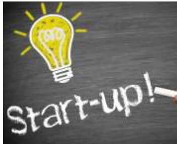
Startup Ventures Facilitation Platform