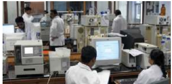
National Knowledge Resource Centre