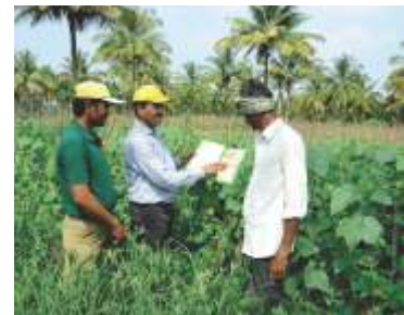
IndGAP Certification and Stewardship Programs